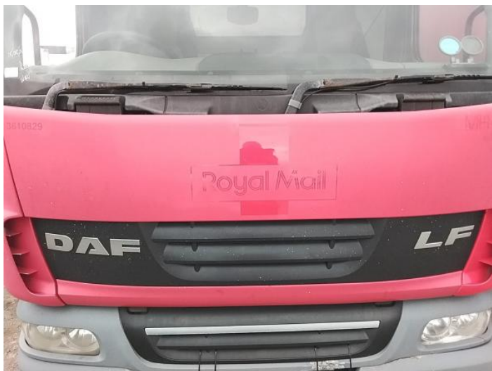
1: Bonnet Chipped Multiple Chips