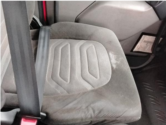
5: Seat Base Cover nsf Soiled Heavy