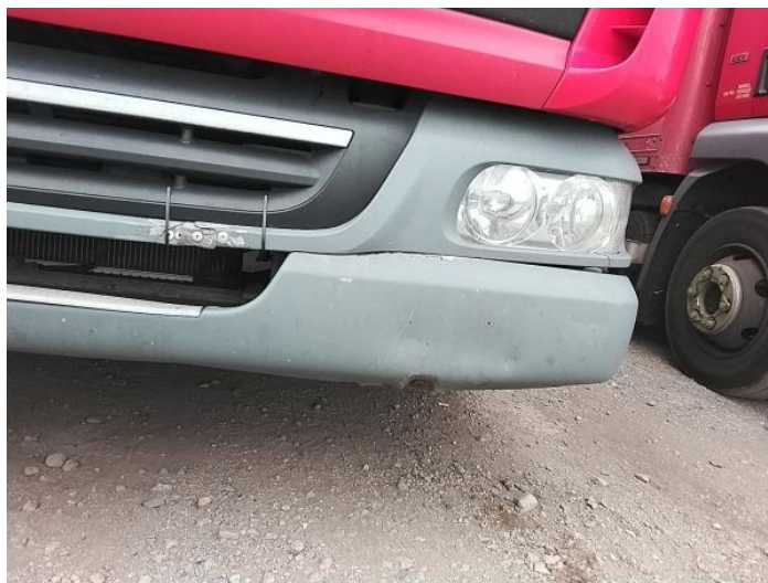
2: Bumper Front Dented With Paint Damage