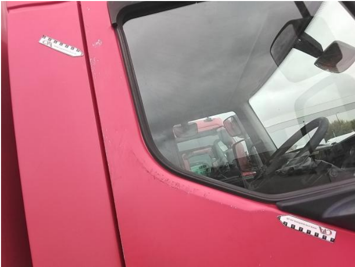
3: Door osf Scratched Over 25mm Thru Paint