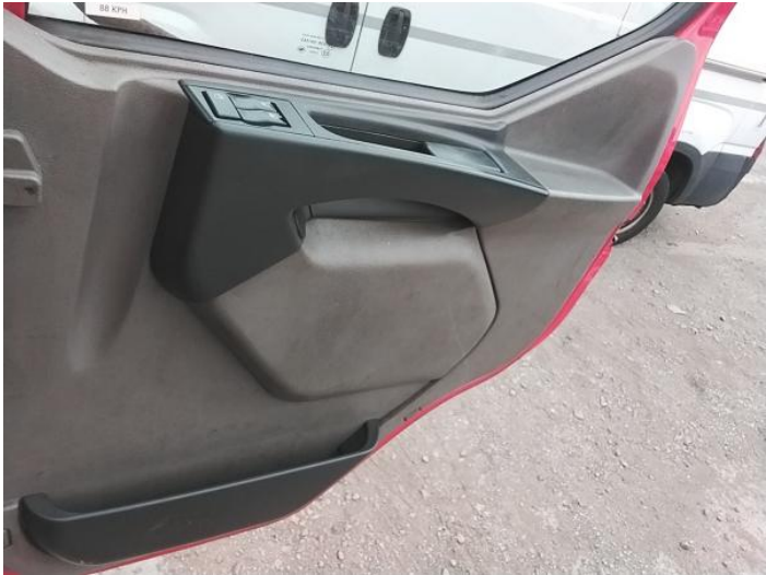
4: Door Pad osf Soiled Heavy